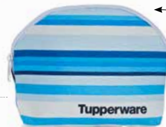
Blue Ocean Accessory Bag 8 x 1¾ x 6"/20.3 x 4.4 x 15.2 cm.