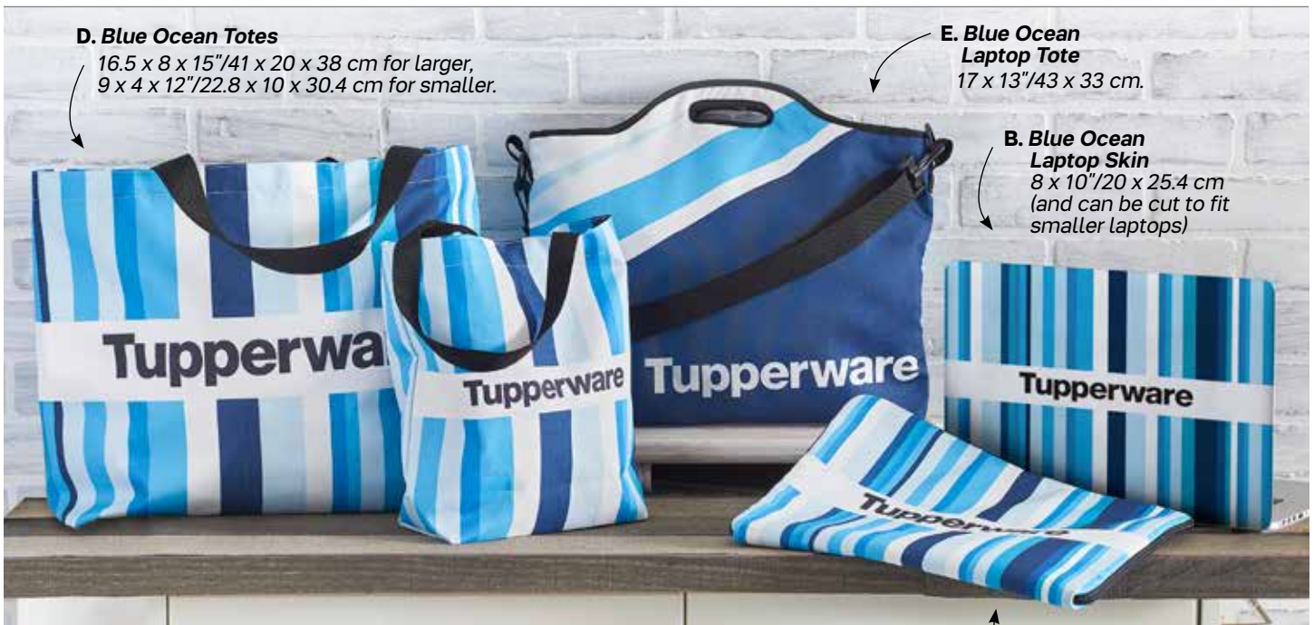
D. Blue Ocean Totes

16.5 x 8 x 15"/41 x 20 x 38 cm for larger, 9 x 4 x 12"/22.8 x 10 x 30.4 cm for smaller.